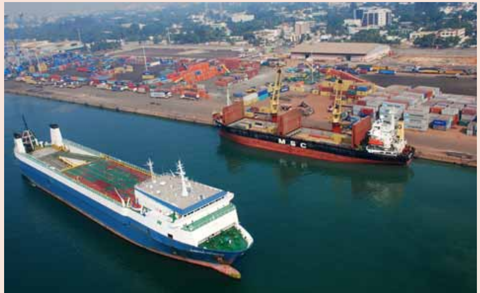
Port of Cotonou, Benin. MCC investments of $180 million over 5 years have doubled container capacity and cut customs clearance times in half.

Across the world, MCC acts as a gateway to opportunity for U.S. firms looking to expand. MCC has partnerships with countries in Latin America, Africa, Europe, and Asia; in each country, the local implementing unit—known as a Millennium Challenge