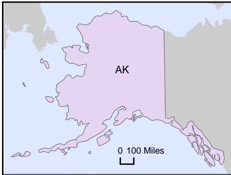
Figure 3: Percent of Total State and Local Expenditures on Public Welfare