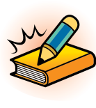
Reading & Writing