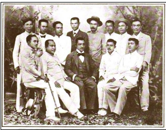
Presidentes of the Towns of Jaro and La Paz, with the Governor-Supervisor Delgado (bottom-center) of the Province of Iloilo (Visayans), c. 1903. From the 1903 Census of the Philippines.

With passage of the Philippine Organic Act of 1902 (July 1902), U.S. government officials determined the Philippines would be governed in part by a representational Philippine Assembly but needed a census to do so. Additionally, the Organic Act stipulated that the census would not be conducted until the cessation of hostilities, and that the Assembly could only be formed if there was peace for 2 years after the census was completed. Accordingly, the 1903 Census of the Philippine Islands had major implications for the governance of the islands.