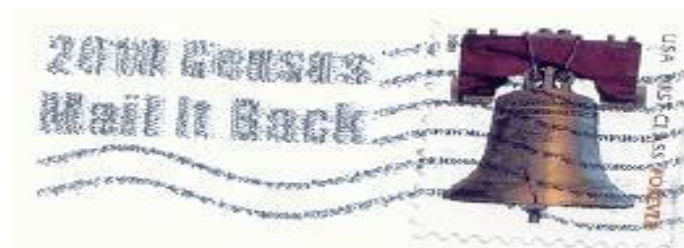
Figure 2: Picture of the First Class Mail Cancellation Stamp

Another interesting example of the mix of paid and value-added partnership activities was the national stamp cancellation promotional message of “2010 Census Mail it Back” that was applied to almost 1.5 billion pieces of regular mail that flowed through the postal system between March and April 2010. See Figure 2 below displaying an image of regular first-class mail with a postage stamp that had been through the postal system. Of course, the Census Bureau has a long ongoing business relationship with the United States Postal Service (USPS) delivering the decennial census questionnaires and hundreds of other ongoing surveys. The NP Nerve Center sought to leverage Census Bureau-funded business transactions into additional partnership activities. In addition to the stamp cancellation promotional message, a custom made 2010 Census promotion poster was hung in every one of the over 31,000 post offices across the nation during the Spring of 2010.