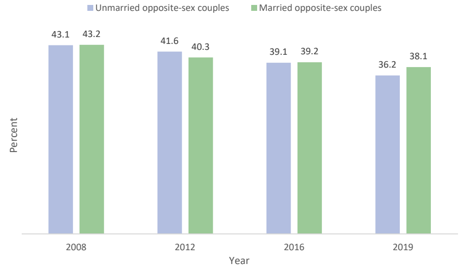
Figure 1b. Percent of Opposite-Sex Households with Children Under 18 for Selected Years

* Prior to 2013, those reported as same-sex spouses were shown as unmarried partners in the data.