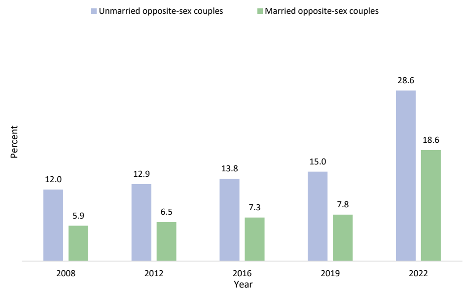
Figure 2b. Percent of Opposite-Sex Couple Households That Are Interracial for Selected Years

For information on confidentiality protection, sampling error, nonsampling error, and definitions in the American Community Survey, see https://www2.census.gov/programs-surveys/acs/tech_docs/accuracy/ACS_Accuracy_of_Data_2022.pdf .