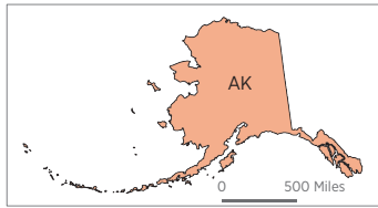
Figure 9. Difference in Poverty Rates by State Using the Official* and Supplemental Poverty Measures: 3-Year Average 2019 to 2021